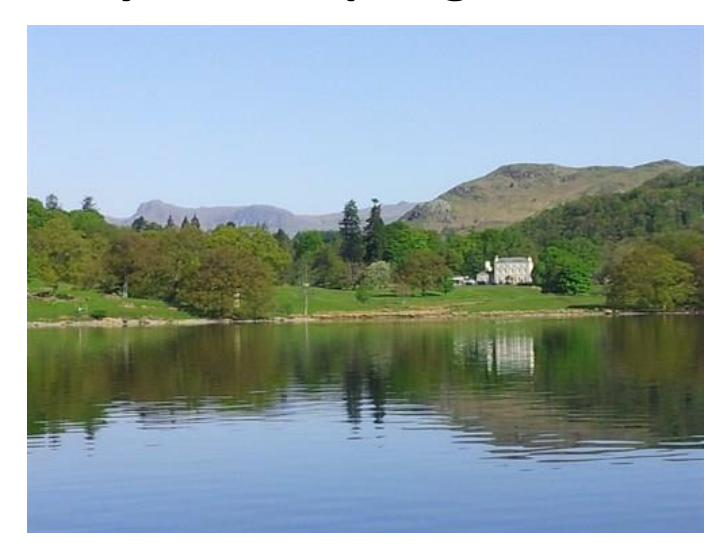
A place for reflexive contemplation and learning on all things systemic!