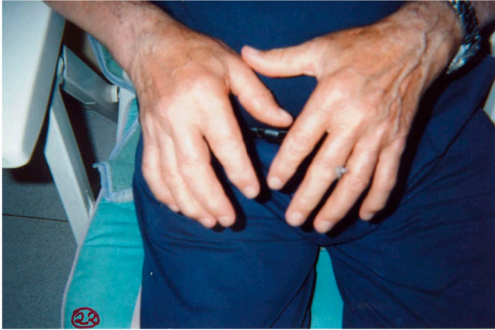
Figure 5. Max's photograph of a significant person in his life.