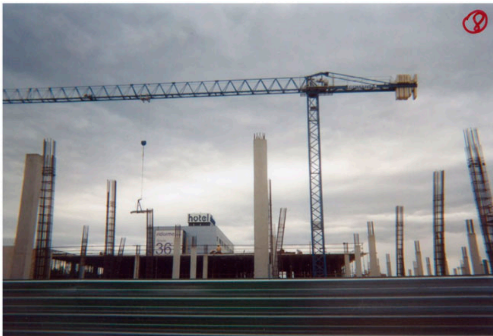
Figure 3. Robert's photograph of an unpleasant space.

Figure 3 is a photograph taken by Robert showing the difficulties he has facing up to everyday activity in the street: traffic, vehicle noise, and roadworks. Robert suffers from agoraphobia and the visual and auditory stimuli in the street destabilize him and make him feel uneasy: