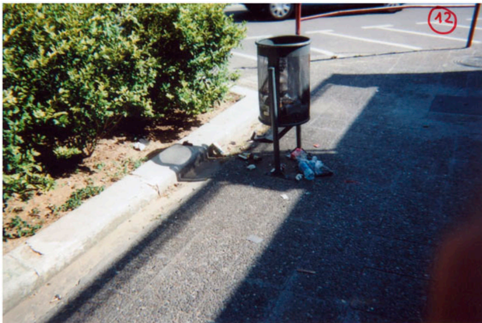
Figure 4. Max's photograph of an object that symbolises an unpleasant feeling.